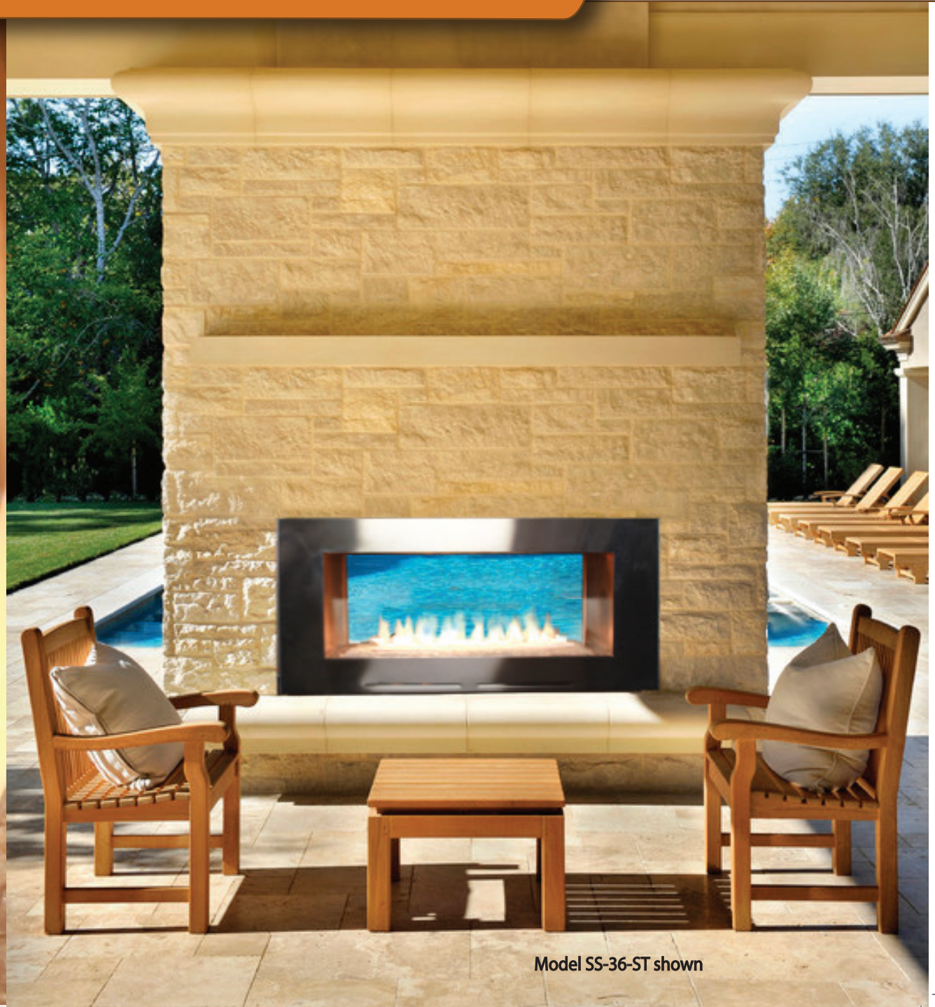
Model SS-36-ST shown

Innovative Design Quality Durability Reliability